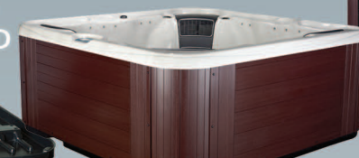
MAINTENANCE FREE ETERNALWOOD CABINETRY