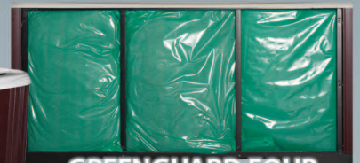
GREENGUARD FOUR CHAMBERED LAYERED ROXUL INSULATION